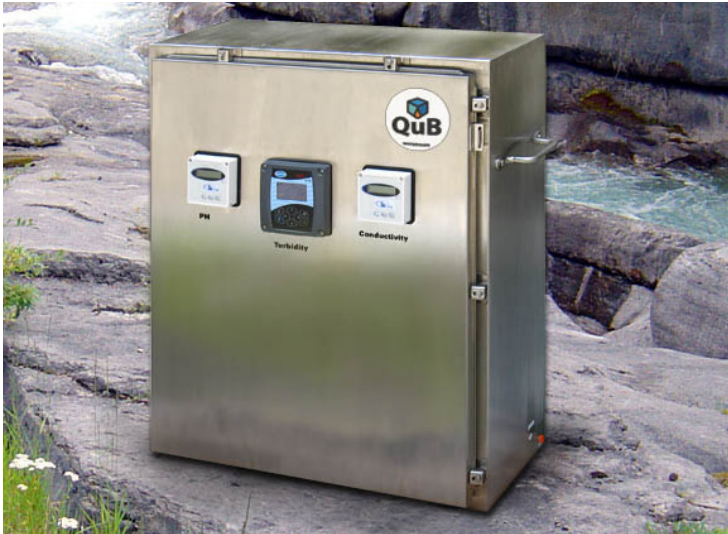
The Water Quality QuB Monitoring System by Eyasco.

Everything you need to measure the most critical parameters for water quality.