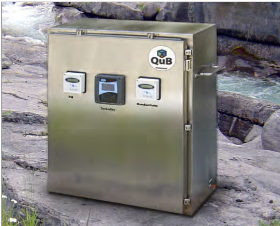
The Water Quality QuB Monitoring System by Eyasco.

Deploying the Water Quality QuB is the first step to being a better water quality manager.